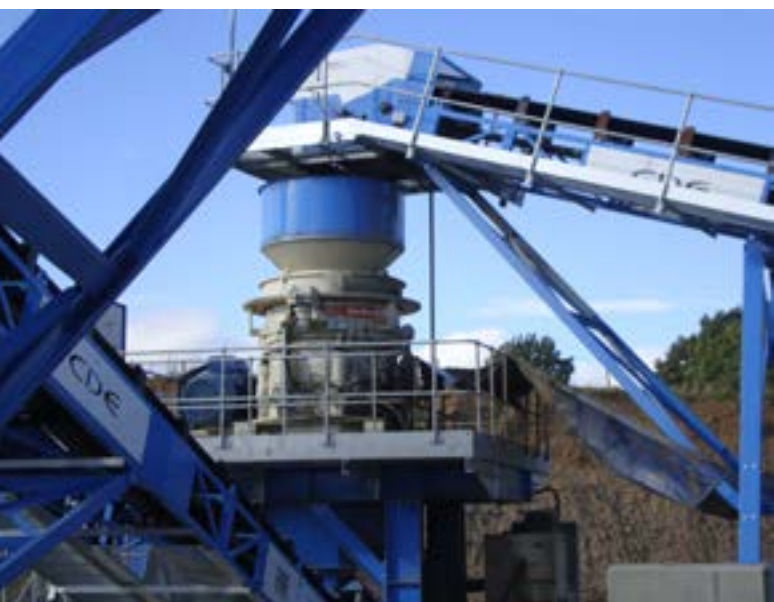
‘CDE produced an integrated solution combining both jaw and cone crushers with the washing plant.’

The P2-75 underflow (-5mm) is then fed to the EvoWash 152. The modular design of the EvoWash ensures highly accurate separation of silts and clays from material, guaranteeing production of specification sands. The primary product from the EvoWash 152 is the 0-5mm concrete specification sand. There is a facility to increase or decrease the