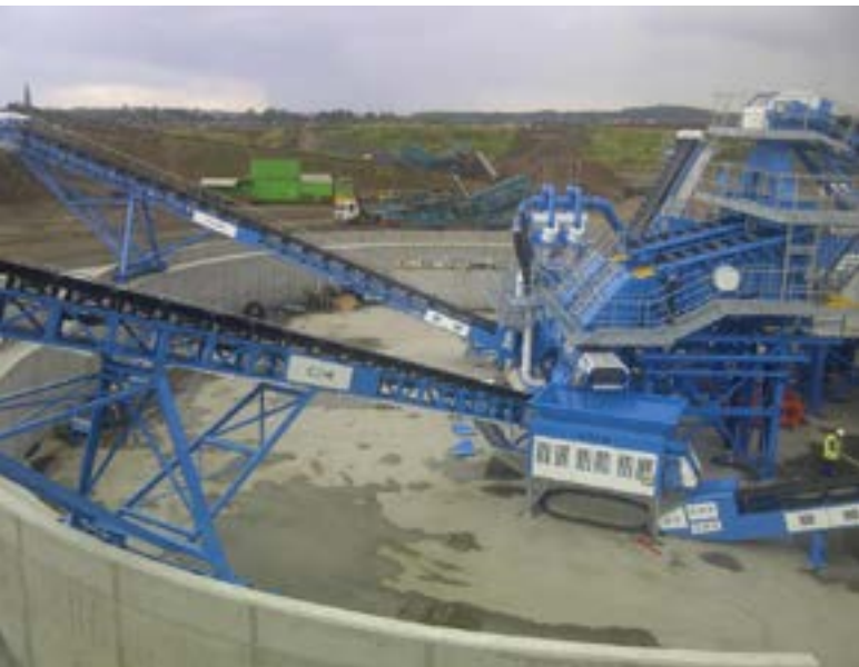
'The +5mm-25mm material is stocked via a radial 26m conveyor as per their required specification concrete aggregate.'