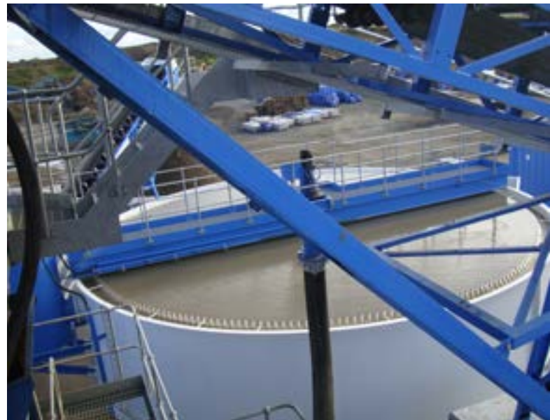
'The AquaCycle reduces the volume of fresh water required to feed the washing plant by up to 90%, meaning the potential environmental impact is kept at a minimum.'

bottom end 0-2mm in the concrete sand meaning that the concrete sand specification can be maintained easily on site. Any excess 0-2mm is stockpiled for other uses within the quarry operation.