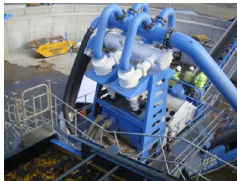
‘The modular design of the EvoWash ensures highly accurate separation of silts and clays from material, guaranteeing production of specification sands.’