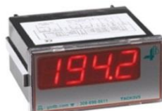
Tacho Speed Display

Whirligig®: U.S. Pat # 6,109,120 Mag-Con™: U.S. Pat # 6,964,209